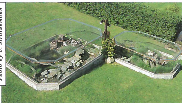
The outdoor enclosures of the author upon completion

mine the size and height of the glass surrounding, which, of course, depends on the size of the animals. According to my experience a size of 70-80 cm will work for animals of a length of 100-110 cm. As you can see on the scheme, this height has been chosen for the big outdoor enclosure. Due to the fact that the smaller enclosure was built for breeding young animals, a height of 50 cm was sufficient.